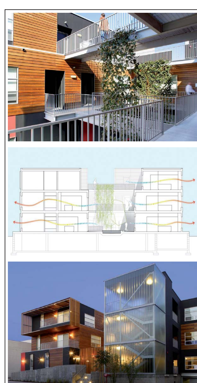
LOHA Architects, Gardner1050